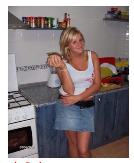
Lodging's Rules: Please read carefully.

More of the families and shared apartments are within walking distance, as is almost everything in Alicante. Some students will have to use the bus 10 or 15 minutes. Distance to the school will not be a reason to change your lodging.